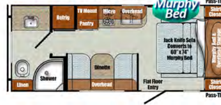
19MBS L: 23'1", Wgt: 3,192 lbs.