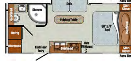
19MBS L: 23'1", Wgt: 3,192 lbs.