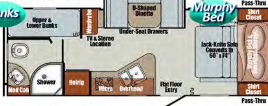
23BHS L: 26'1" Wgt: 4,253