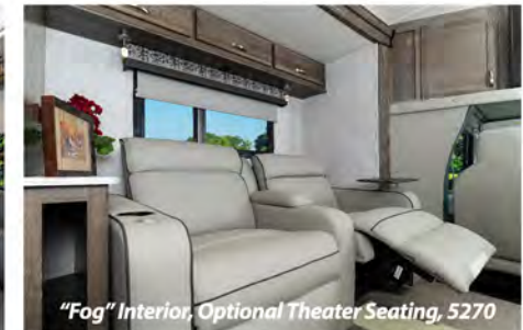
"Fog" Interior, Optional Theater Seating, 5270