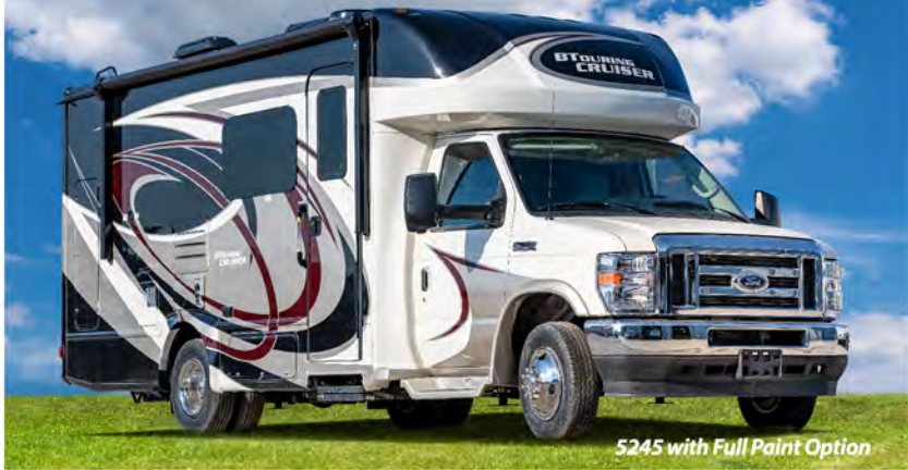
5245 with Full Paint Option