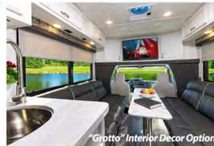
"Grotto" Interior Decor Option